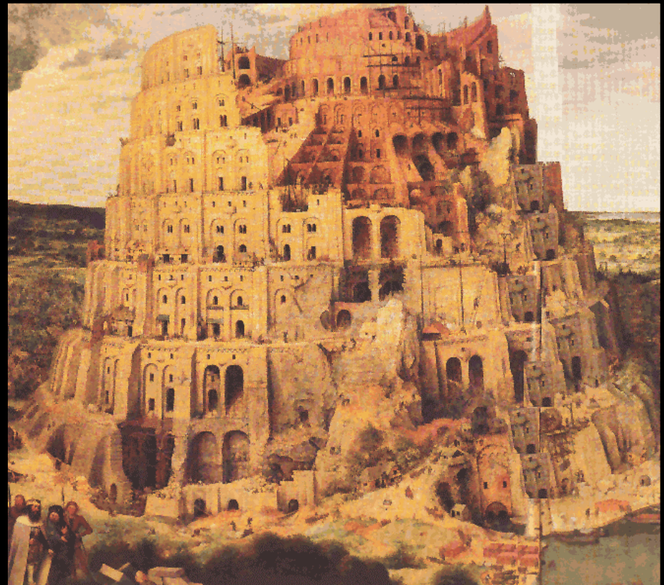
Tower of Babel, Bruegel, 1563

Each of these provides a formal framework for reasoning about certain aspects of embedded systems.